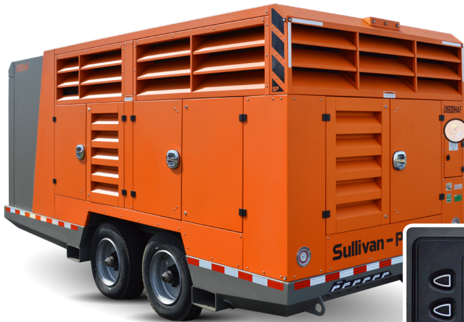
Sullivan-Palatek Electronic Controller (SPEC)