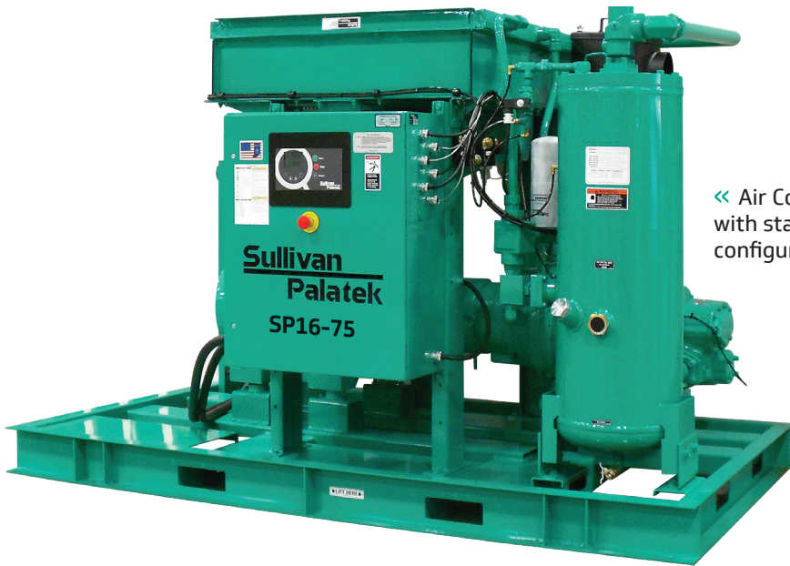
« Air Compressor shown with standard open configuration.

*Please consult factory for additional pressure options.