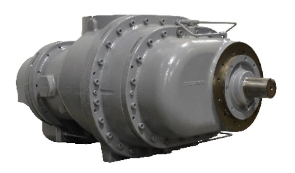
SAE # 1 Engine Adapter