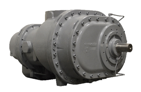
SAE # 3 Engine Adapter