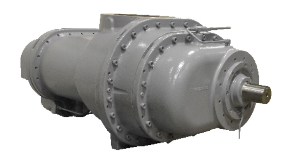
SAE #0/#1 Engine Adapter