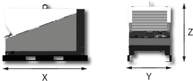
» Figure 2. Available skid mount design shown above (D110SKUW)