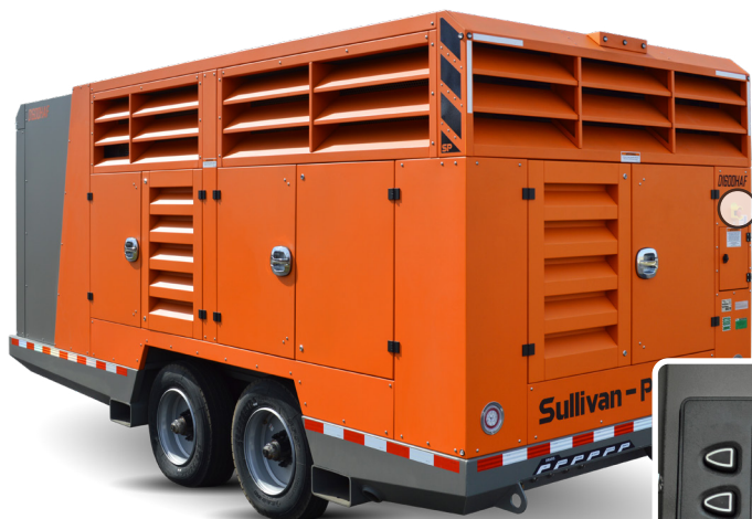
Sullivan-Palatek Electronic Controller (SPEC)